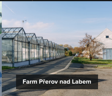
Farm Přerov nad Labem